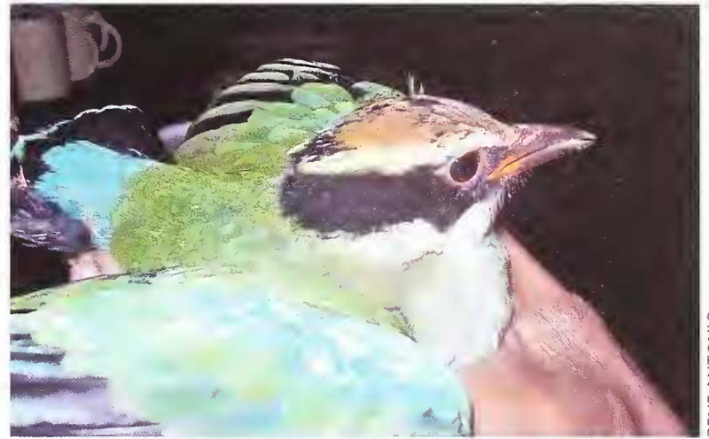
Plate 12. Immature Fairy Pitta Pitta nympha , Pandanan, Malinsuno Island, Balabac, Palawan, 30 September 2013.